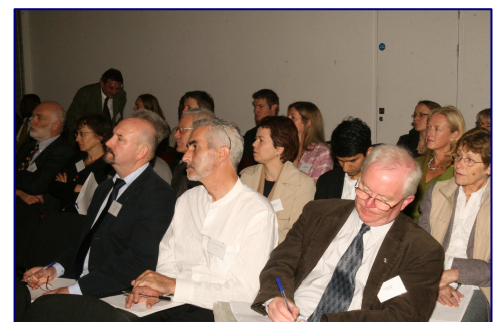
Some of the visitors who attended the EIW International Launch in September

All EIW products – including samples of our training materials – are available to download free from our website www.eiworkplace.net